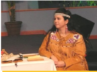
Native American Culture.