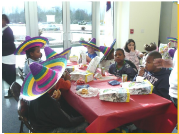
Children enjoying their sombreros.