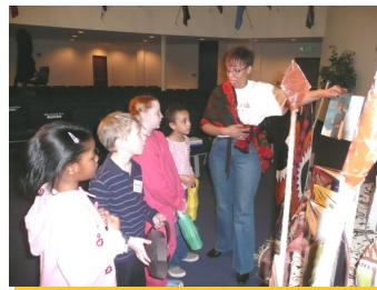
Children learning about African Culture.